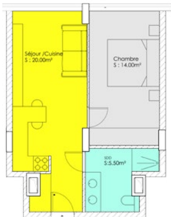
Example - Apartment #10 40,71 m 2

No more unpersonal hotel nights, now you can sleep at home! And it is profitable!